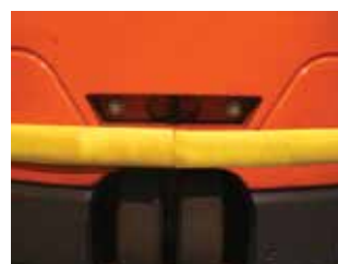
Safe-Bump protects both the forklift and anything it hits