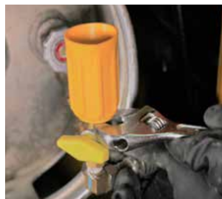
INSTALL COUPLER ON PROPANE VALVE WITH A WRENCH