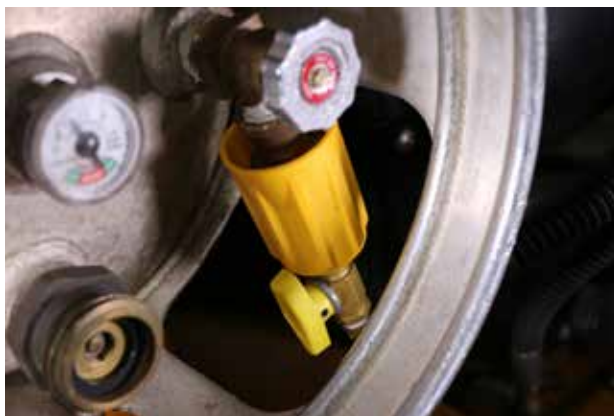
QUICK CHANGE PROPANE VALVE IN-USE