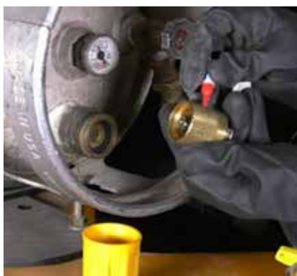
ADD GLUE TO COUPLER AND SAFETY GRIP