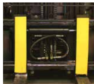
Safe-Bump attaches to 4", 5" and 6" forks in seconds

Size: 18" (457 mm) L x 4" (102 mm) W x 2" (50mm) D