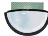
Tape Dome Mirror