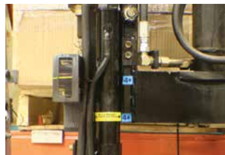
Correct Fork Height for Entry and Exit of Pallet

The second marker indicates the safe lift height of the pallet to be either removed from the rack or to be placed into the rack.