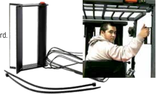
Standard model shown. Battery model available.