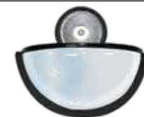
Magnetic Dome Mirror

Ideal Warehouse Innovations' Side Magnetic Mirror provides a side-view of the operator's surroundings for safety and can mount anywhere in the operator's compartment in seconds using the magnetic arm attachment.