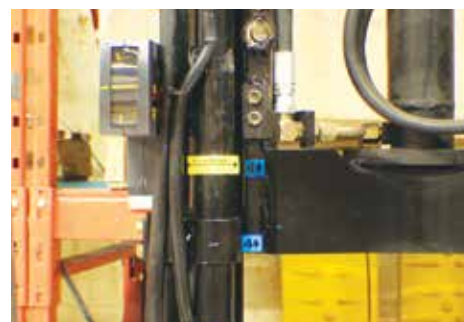
Correct pallet Height for Entry and Exit of Pallet

Sticker Set - installs on rack system. Tells the forklift operator the correct marker to use on the mast.