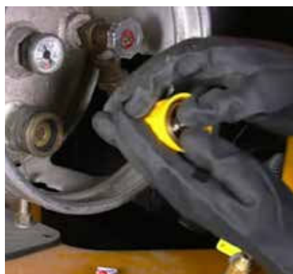
PUSH COUPLER THROUGH SAFETY GRIP