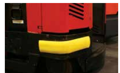
Safe-Bump can bend 90° to wrap around corners for maximum protection