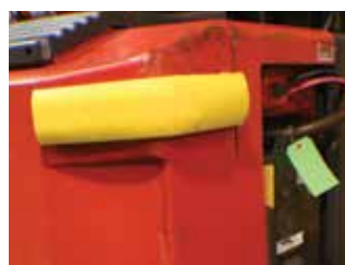
Using two way tape, non-metal surfaces can be protected