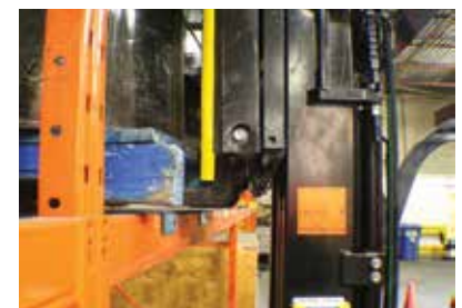
Safe-Bump is only 2" (50mm) thick and protects product from damage